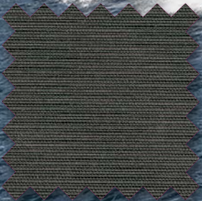
GRAPHITE SG431 X