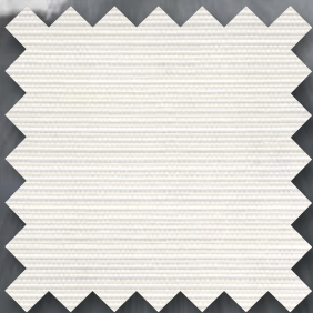
WHITE SG371 X