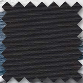
BLACK SG355 X