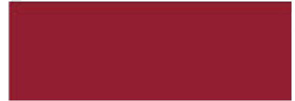
745 441 RUBY RED