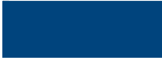
745 548 DEEP BLUE