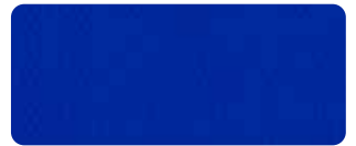
Blue 98 in